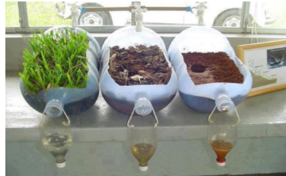
Figure 3. Water carries a huge amount of soil down streams and rivers and perennial vegetation acts as a living water filter.

Many pesticides and fungicides have antibiotic activity and these materials can add NO x (nitrous oxide) and CH 4 (methane), potent greenhouses, to the atmosphere.